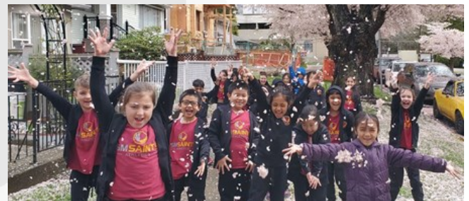
It's a Spring Celebration with Grade 1