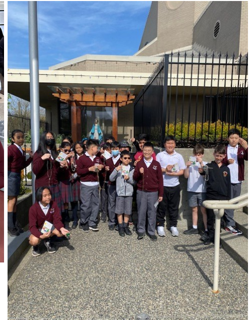
Grade 5SR praying the rosary at the shrine

Grade Two students made un-leavened bread to prepare for their First Holy Communion. We are very excited to be receiving Jesus soon.