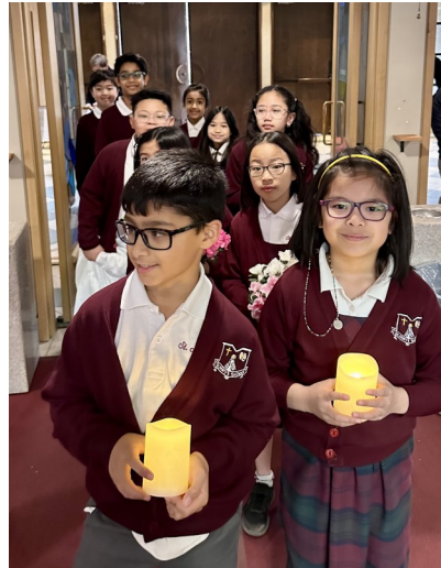
Grade 3 led our April School Mass