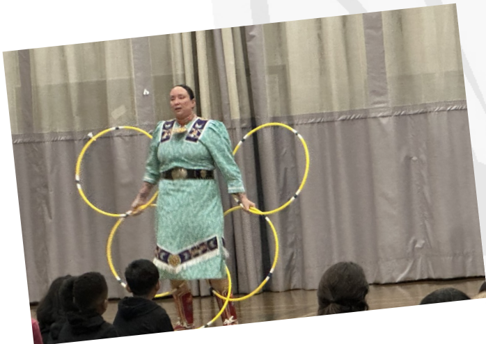
Highly skilled moves using the hoop creates the earth