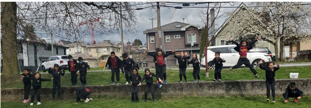
Jumping creatively as we arrive at our happy place!