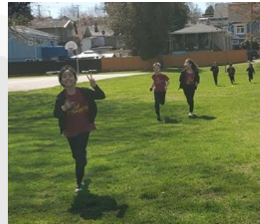
Feeling joy of movement!