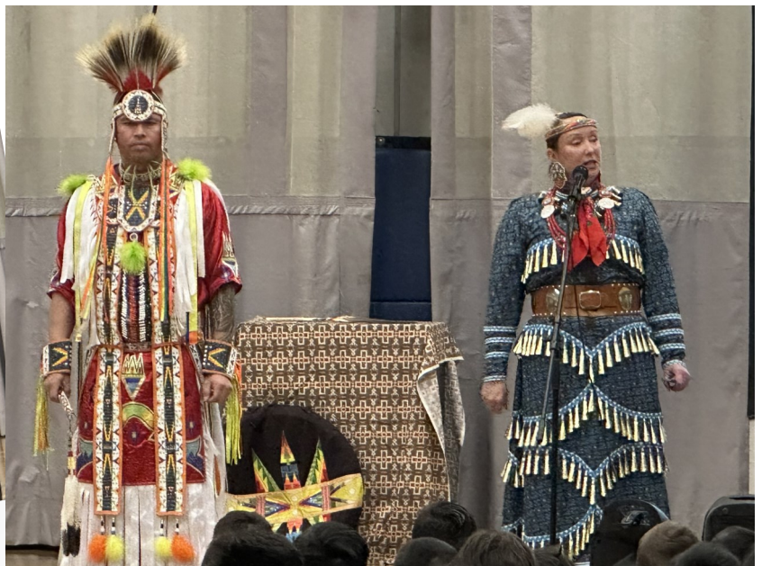
Dance outfits suit different dance styles