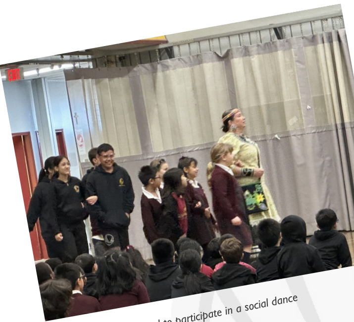
Students volunteered to participate in a social dance

Our students and staff thoroughly enjoyed the high energy Tribal Vision Dance group performance in April. Tribal Vision is a First Nations family dance company based on the Six Nations Reserve in Ontario, Canada. The Company is made up of Champion Dancers and a World Class singing champion. They love sharing their rich culture with people the world over. The dance styles that were presented are dances you would see if you attended a Powwow. A Powwow is a social gathering where First Nations people from all over North America (Turtle Island) come together to sing, dance, visit, arrange ceremonies and give thanks to the Creator. Students learned about the feathers and bells on their dance outfits and how the drum represents the heartbeat of Mother Earth.