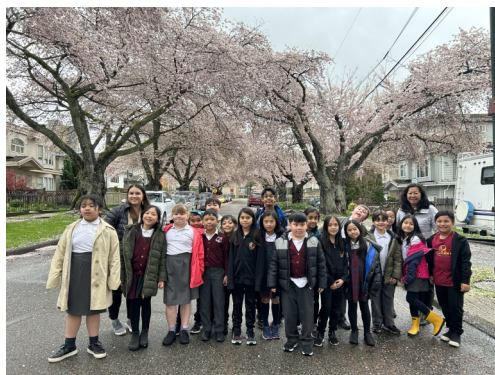
It is Grade 3P on our Earth Day walk