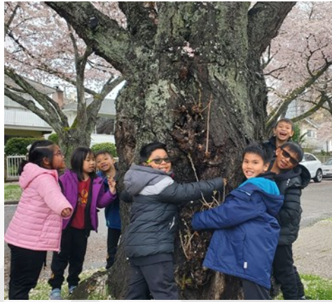
Grade 2MB showing love for nature on Earth Day